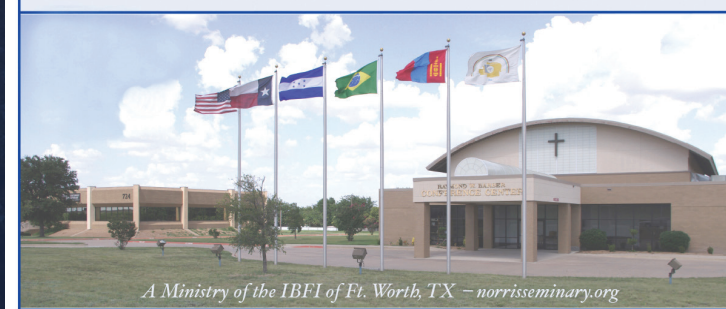
A Ministry of the IBFI of Ft. Worth, TX – norrisseminary.org

44 of the 48 Courses are in Bible, Theology or Church Ministry – 24 of the 48 Courses are Just in Bible, 8 in Theology